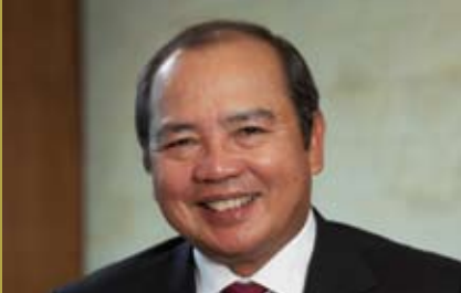
Burhanuddin Abdullah Governor

The year 2007 is of particular significance in the history of the Indonesian economy, marking the tenth year since the Asian crisis. In the last decade, we have witnessed many important developments that have taught useful lessons for our journey together in building a stronger Indonesian economy at this early stage in the 21st century. In the last five years, Indonesia has passed through a transition from the depths of the multidimensional crisis to a renewed consolidation of economic development to strengthen the key foundations of our national economy. The fruits of this consolidation process have begun taking shape with the various economic achievements of 2007.